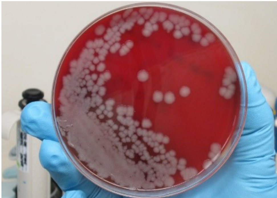
Bacillus anthracis culture

The 1540 Committee is assisted by a group of experts, whose members and coordinators are elected by the Committee itself and appointed by the Secretary-General.