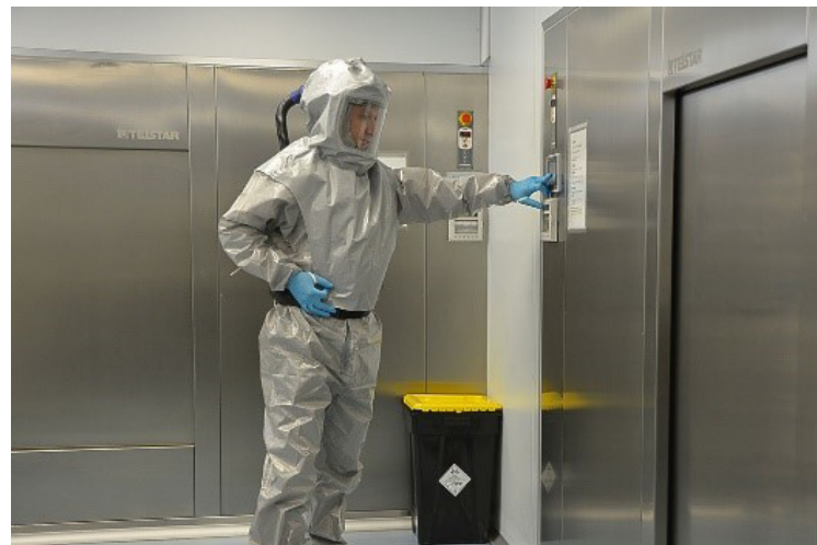
Researcher in a P3 laboratory at the National Microbiology Centre

Each sovereign State is responsible for guaranteeing the physical security of biological agents and materials, as well as of the facilities in which said materials are produced, used or stored, including their transport by any means or channel used.