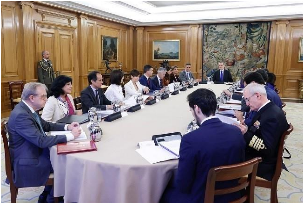
Meeting of the National Security Council 12 April 2023

of the Government. In 2023, it met on 14 February and on 12 April, also chaired by the President of the Government.