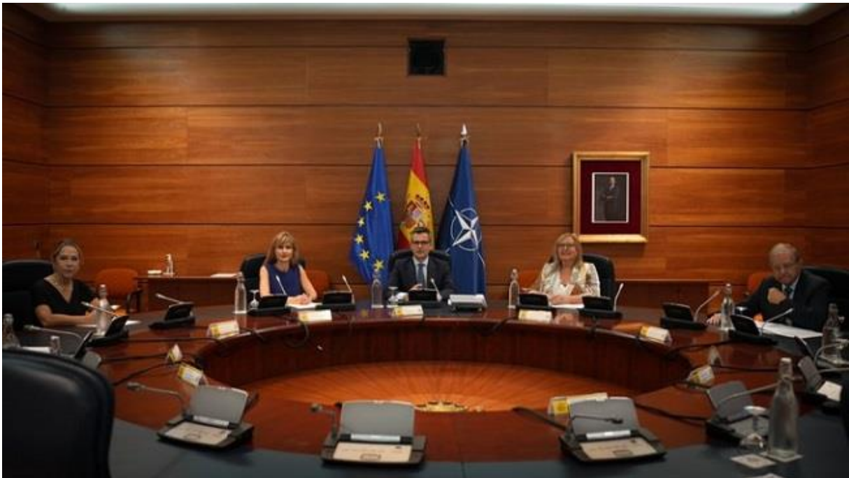
Meeting of the Situation Committee January 03/10/2023

Ever since their establishment, these working groups include the participation of duly designated ministerial departments and agencies. They are organized to ensure an active coordination, monitoring and management of the crisis, as well as to verify and increase the effectiveness of the measures approved.