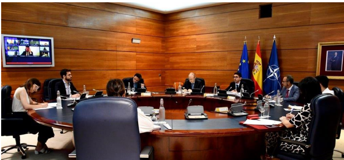
The Working Group 27/06/2023.

The EU temporary protection mechanism was activated on March 4, 2022 and was automatically extended for one year, until March 2024. On September 28, 2023, the Council of the European Union agreed to extend the temporary protection of people fleeing the conflict between Russia and Ukraine from March 4, 2024 to March 4, 2025. The Minister of the Interior of Spain has assured that «EU will support the Ukrainian people for as long as necessary».