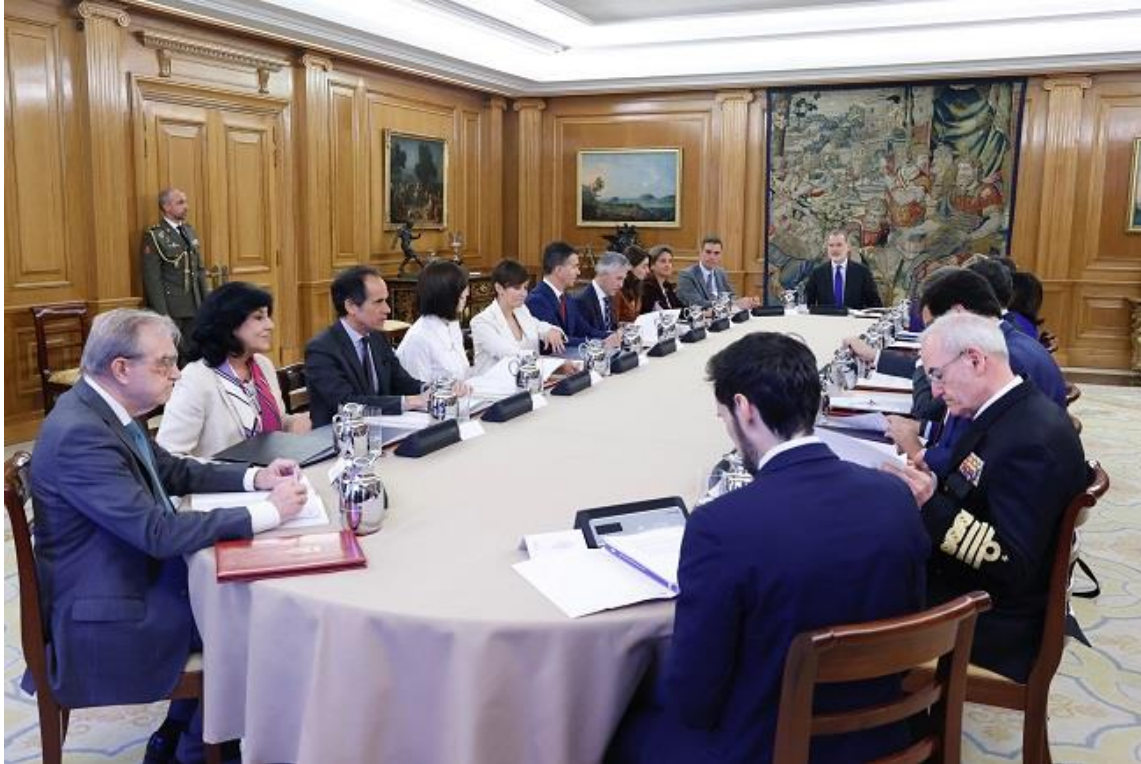
Meeting of the National Security Council 12 April 2023

For its part, the Situation Committee —the highest level of coordination, chaired by the Minister of the Presidency, Félix Bolaños— has met up to 23 times since its first meeting on February 2. During its last meeting, held on 27 June 2023, the Committee analyzed the status of the conflict between Russia and Ukraine, as well as its repercussions in different areas at the national and international level.