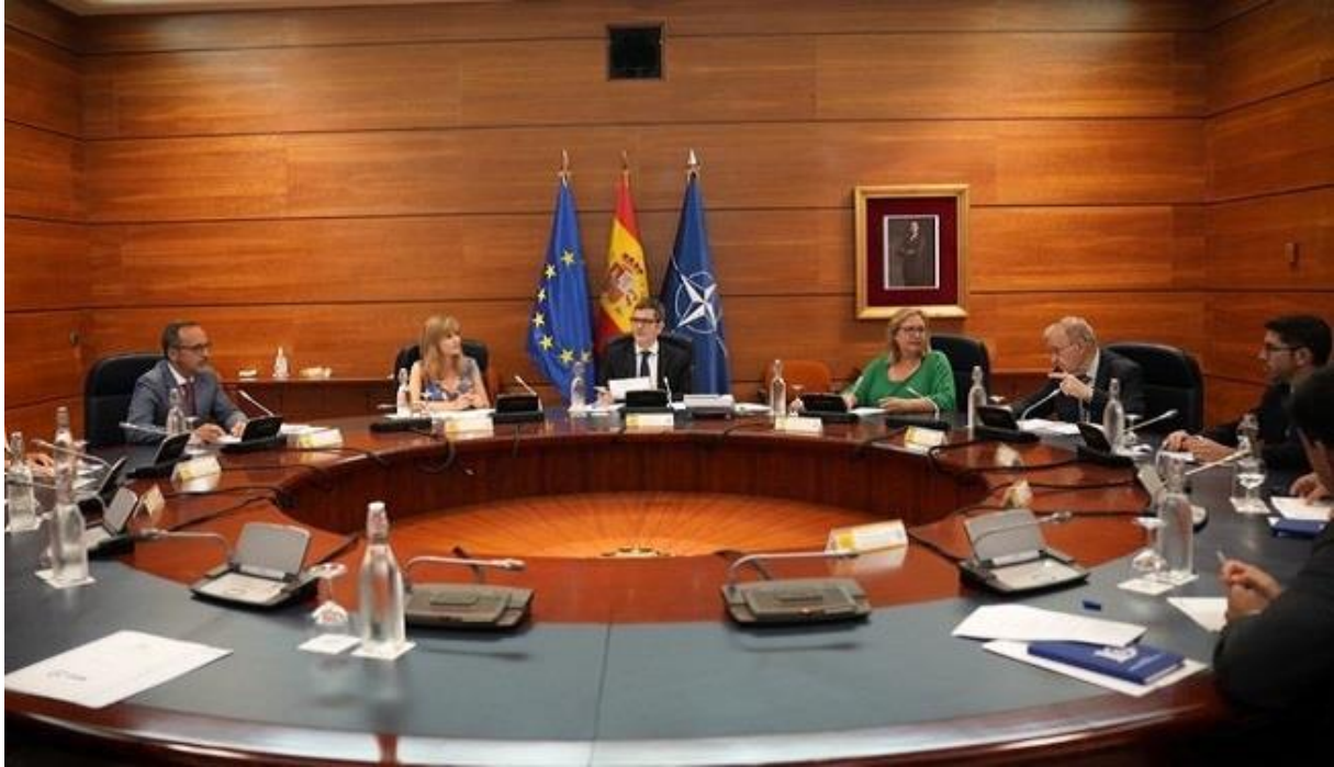
Meeting of the Situation Committee June 27 2023

Ever since their establishment, these working groups include the participation of duly designated ministerial departments and agencies. They are organized to ensure an active coordination, monitoring and management of the crisis, as well as to verify and increase the effectiveness of the measures approved.