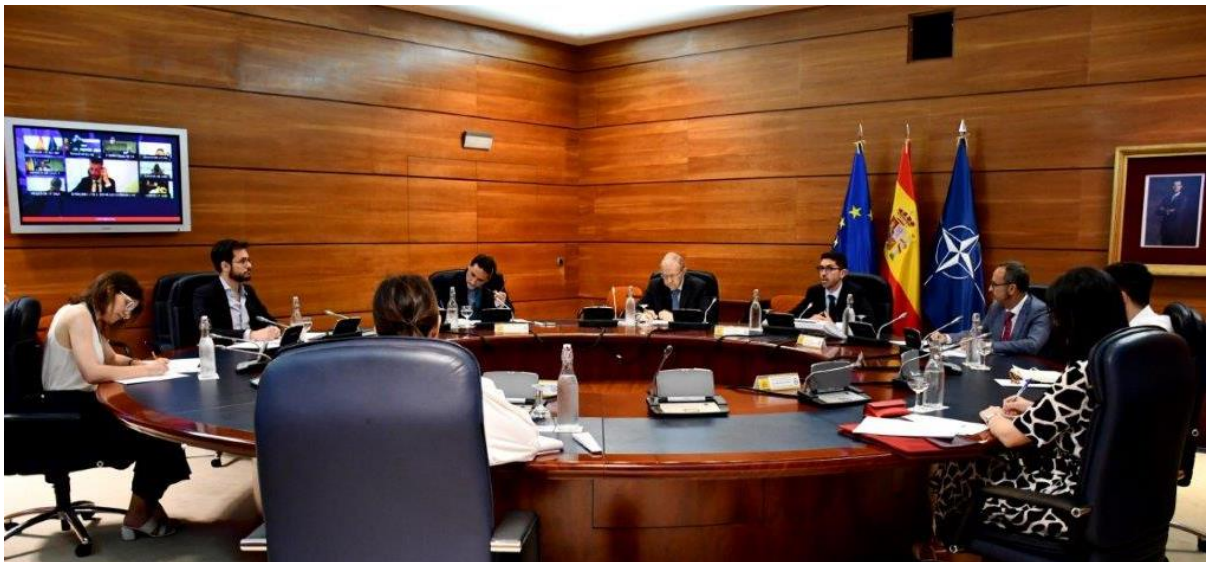
Reunión del Grupo de Trabajo de Recepción y Protección Temporal 27/06/2023.