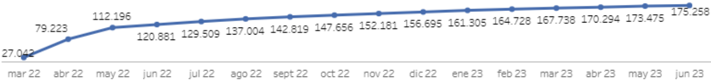
Evolución de extranjeros ucranianos. Diciembre 2021 - junio 2023 Ambos sexos. Total edad. Vía acceso residencia: Directiva de Protección Temporal