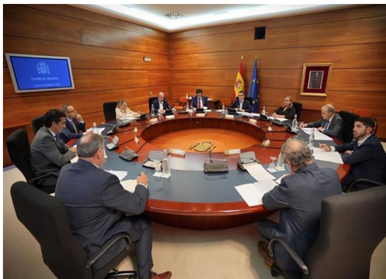
Meeting of the Situation Committee 10 October 2022