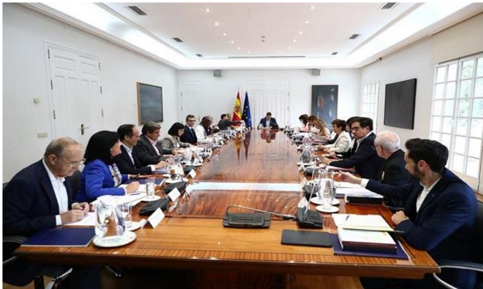
Meeting of the National Security Council 11 October 2022

The National Security Council has met four times to analyze the situation caused by the Russian invasion of Ukraine, as well as its repercussions in Spain and in everything that affects the daily life of citizens: on February 24 —chaired by His Majesty the King —; and on March 4, June 21 and October 11, chaired by the President of the Government.