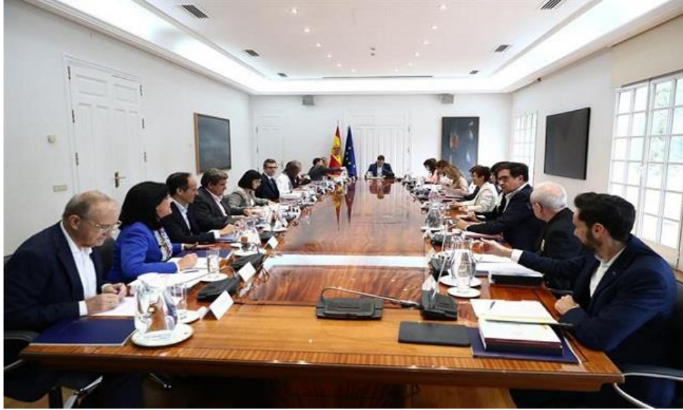
Meeting of the National Security Council 11 October 2022

Since its first meeting on February 2, the Situation Committee (the highest level of coordination chaired by the Ministry of the Presidency) has met up to 19 times. During its last meeting, held on November 25, the Committee set up a new Working Group to coordinate all matters related to the energy crisis caused by Russia's invasion of Ukraine.