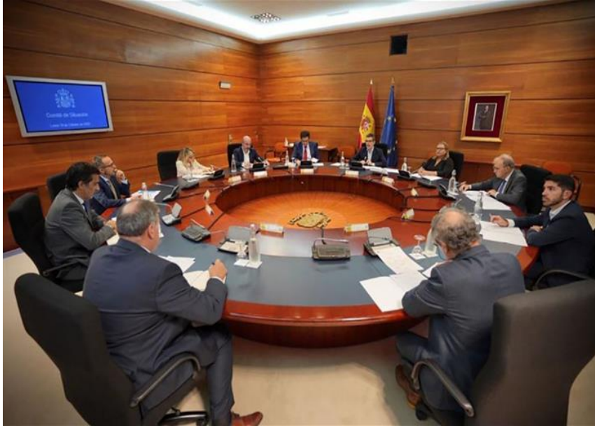
Meeting of the Situation Committee 10 October 2022

Ever since their establishment, these working groups include the participation of duly designated ministerial departments and agencies. They are organized to ensure an active coordination, monitoring and management of the crisis, as well as to verify and increase the effectiveness of the measures approved.